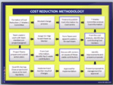
Art No : A51 Cost reduction Methodology S$13 / pc