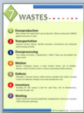
Art No : A041 7 Wastes S$9 / pc

PS : S$5 delivery charge for local delivery.