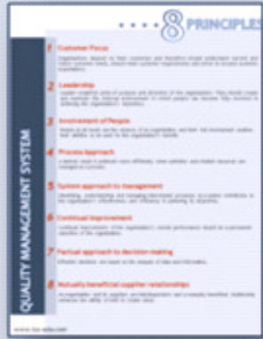
Art No : A012 8 Principles S$10 / pc