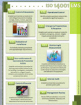
Art No : A021 ISO 14001 Requirements S$16 / set